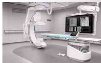
Azurion 7 C20