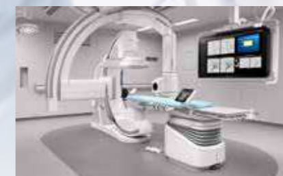
Azurion 7 B20/15