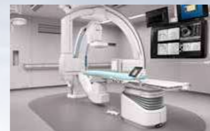
Azurion 7 B12/12

The Azurion 7 biplane is available in different configurations to support neuro, congenital heart, structural heart, electrophysiology and other complex cardiac and vascular interventions. The biplane system with two 12" Flat Detectors provides high-resolution imaging and positioning flexibility to reveal critical anatomical information during congenital heart and electrophysiology procedures. Enhance insight and certainty during neuro interventions with the perfect fit design that pairs a 20" frontal with a 15" lateral detector. The biplane system with a 20" and 12" Flat Detector provides exceptional clarity of detail and navigational precision to support a wide range of challenging cardiac and vascular interventions.