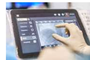
Touch screen module Pro

91% believe that the system will help reduce procedure time 1