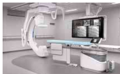
Azurion 7 C12

You can choose a system with either a 12" or a 20" Flat Detector to meet your application requirements. With its new 12" Flat Detector, the 7 Series provides high-resolution imaging over a large field-of-view with flexible projection capabilities, making it ideal for cardiac interventions. The entire coronary tree can be visualized in a single view with minimal table panning. Enhance visibility for diverse cardiac and vascular procedures with the excellent image quality and broad coverage of the next generation 20" Flat Detector. For a hybrid suite solution, the Azurion 7 the next generation 20" Flat Detector can be combined with the FlexMove option.